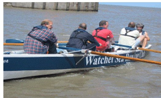
Watchet Sea Rowing Club