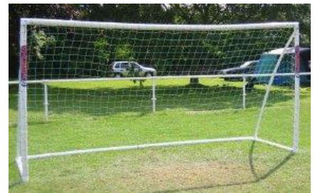
new goal provided by Active Exmoor

Active Exmoor has also provided a set of much needed goals too ensuring that this season gets off to a flying start.