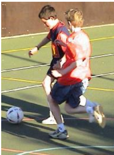
REF in motion

The project was a great success with over 25 regulars attending from Dulverton, Wheddon Cross, Timberscombe, Exford and Carhampton - and now it's back!