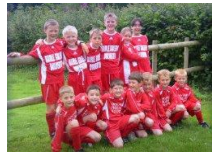
the Dulverton team