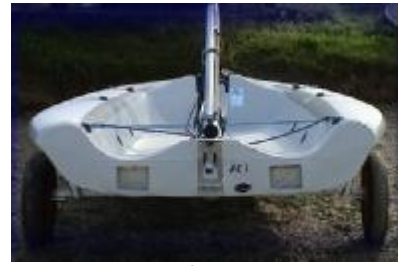
ready to go

The dinghies are being kept at Wimbleball and are free to use - yes free! So if you would like to try sailing for the first time or just fancy a day out with a difference then why not give it a go?