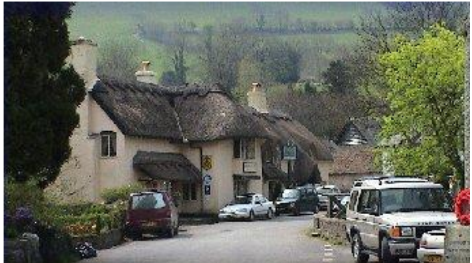
the Royal Oak Inn

So.... looking under the surface we asked what else is on offer in Winsford?