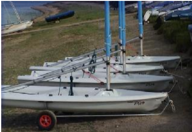
The new Active Exmoor Pico fleet