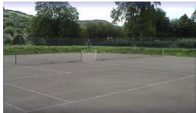
Winsford Tennis Courts

If are not local you are still welcome to play, just make a small donation at Jasmine Cottage to the left of the Post Office on your way back.