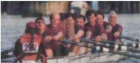
Rowing on Wimbleball

Rowing at Wimbleball Lake is a popular activity and the club is always looking for new members. If you fancy trying it then give them a call. You do not need any experience, you just need to be able to swim and be between 16 and 60.